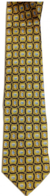
The tie festooned with little Viagras, this week's second prize. See the last poem on this page for a tribute to this fine accessory.

Meanwhile, still running — deadline Monday night: our contest to slightly alter an “A-and-B” phrase (“aid and abet,” “peace and quiet,” etc.) and define the result. See bit.ly/invite1065 .