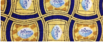
The tie up close. Ha ha ha, UP close. We are such a card.

While Putin quells the rabble, He lets Obama dabble In his feckless, toothless threats. He's heedless to the prattle For Russia means to battle — Not just saber-rattle,