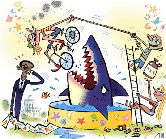
The illustration for today's winning current-events poem. (Bob Staake for The Washington Post)